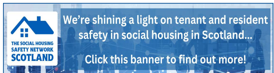
EXAMPLE BANNER (900x240)