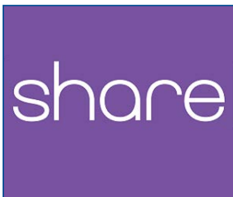
EXAMPLE MPU (300x250)