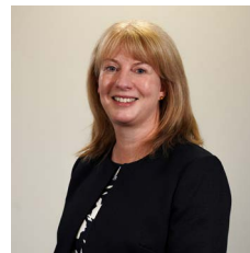
Shona Robison, MSP

Cabinet Secretary for Justice and Veterans