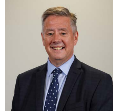
Keith Brown, MSP

We welcome this report and thank everyone involved for the time spent and commitment shown in the development of its recommendations. We will continue working with partners in the housing sector and across the veterans and Armed Forces community to maximise the opportunities available to veterans and to ensure they have the same opportunities as others when accessing services.